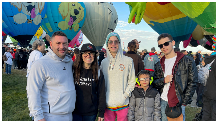
Our Family at Balloon Fiesta 2025

We have a lot to share this month, so make sure you read through it all!